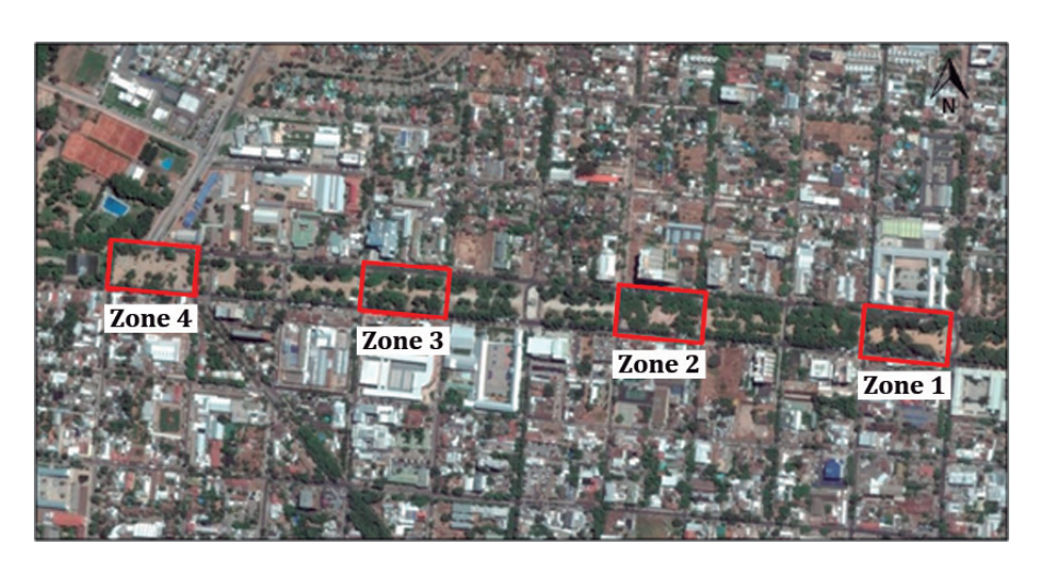
Figure 1. Zones select at Bernardo O'Higgins Ave. (Alameda), Talca. Figura 1. Zonas selecionadas en la Avenida Bernardo O'Higgins (Alameda), Talca.

Each measurement zone was separated for two blocks, in order to achieve greater representativeness. In each zone were located 13 measurement points, equidistant located were established to cover the area comprehensively (table 1 and figure 2, page 46).